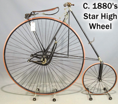
C. 1880's Star High Wheel