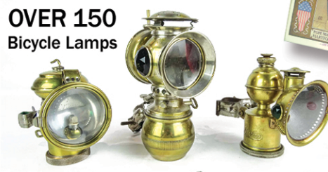
OVER 150 Bicycle Lamps