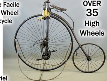
OVER 35 High Wheels