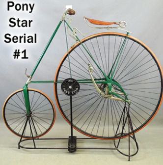
Pony Star Serial #1