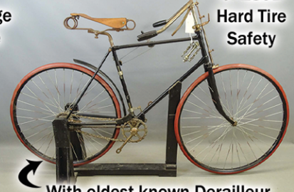
C. 1892 Hard Tire Safety