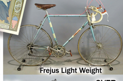
Frejus Light Weight