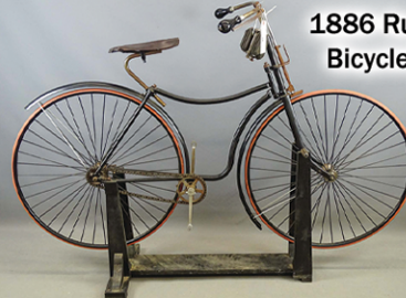
1886 Rudge Bicyclette