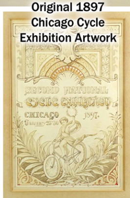
Original 1897 Chicago Cycle Exhibition Artwork