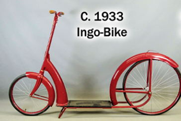
C. 1933 Ingo-Bike