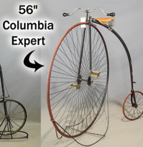
56" Columbia Expert