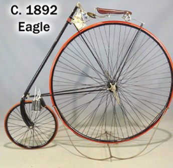
C. 1892 Eagle