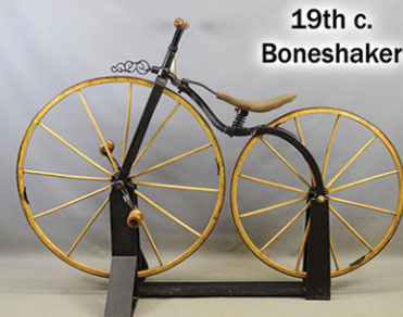
19th c. Boneshaker