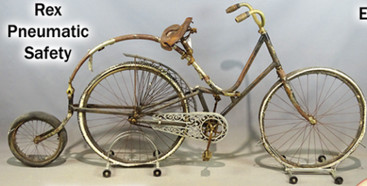
Rex Pneumatic Safety