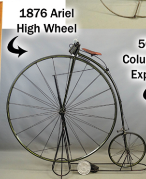
1876 Ariel High Wheel