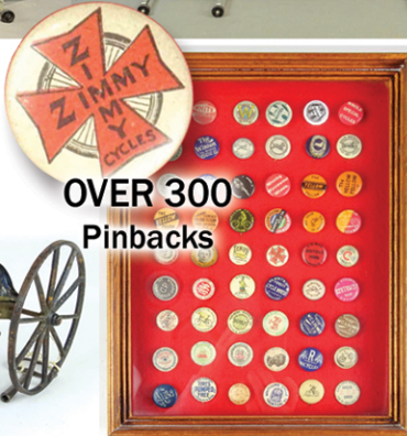
OVER 300 Pinbacks