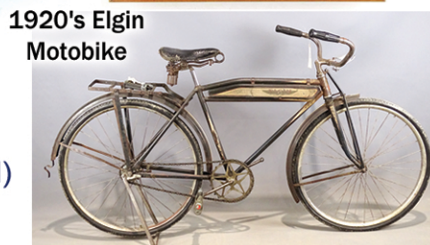
1920's Elgin Motobike