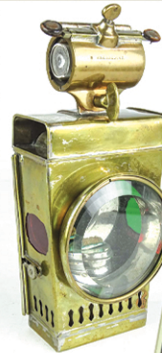
Eureka Hub Lamp