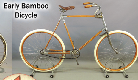
Early Bamboo Bicycle