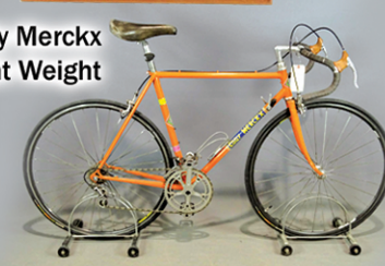
Eddy Merckx Light Weight