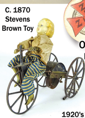
C. 1870 Stevens Brown Toy