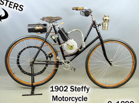
1902 Steffy Motorcycle