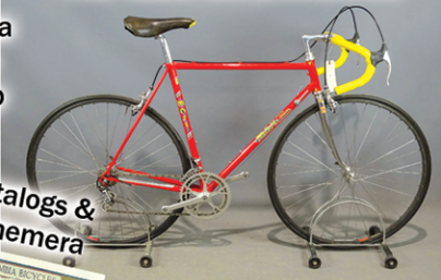
Masi Nuova Strada