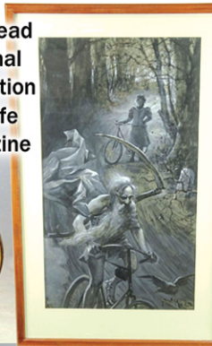
F.W. Read Original Illustration for Life Magazine