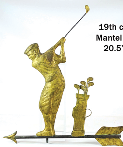
19th c. Iron Mantel Clock 20.5" Ht.