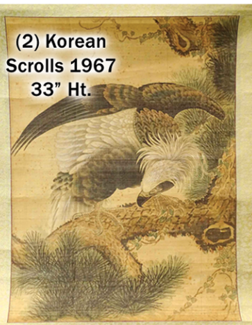
(2) Korean Scrolls 1967 33" Ht.