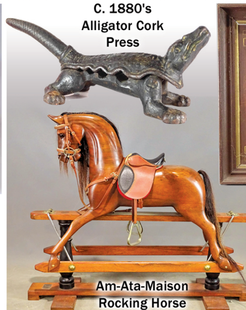
C. 1880's Alligator Cork Press