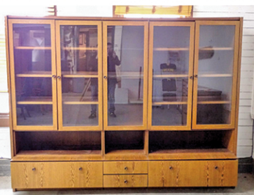
Musterring Dining Room Set