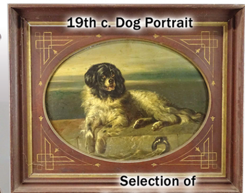
19th c. Dog Portrait