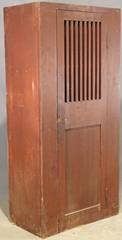
19th c. Cupboard