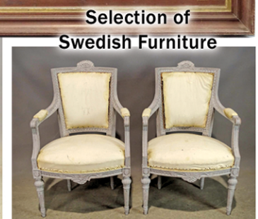
Selection of Swedish Furniture

PREVIEW & BID ONLINE : WWW.COPAKEAUCTION.COM