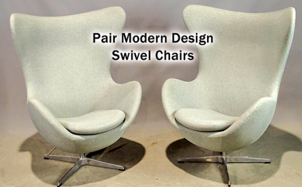
Pair Modern Design Swivel Chairs