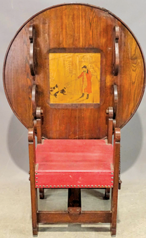
English Arts & Crafts Table