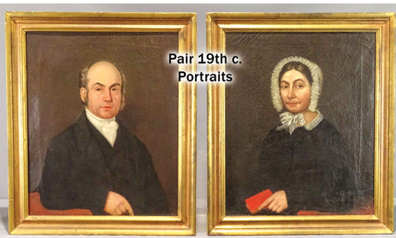
Pair 19th c. Portraits