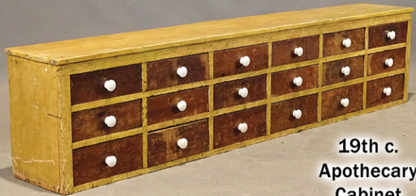
19th c. Apothecary Cabinet