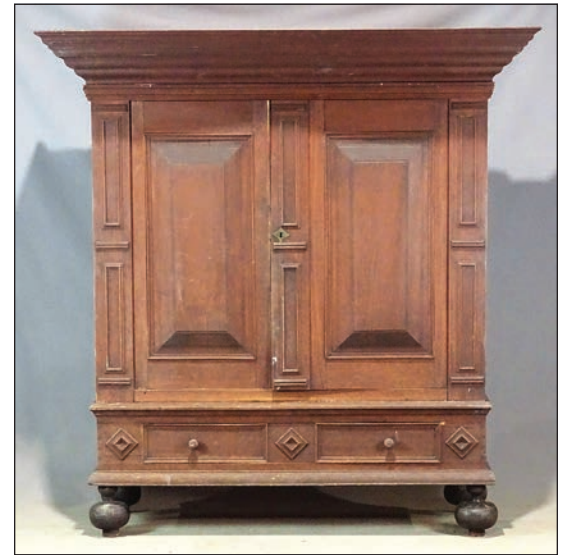
An impressive Eighteenth Century New Paltz kas constructed in three parts — base, case and cornice — stood 8 feet 10 inches high. A rare piece, one of only three known examples with split ball feet, it went out at $6,000.

A painted Parker “Jumper” carousel horse came with appraisal and identification information from well-known carousel dealer Donald “Rusty” Donahue. It leapt to $3,000.