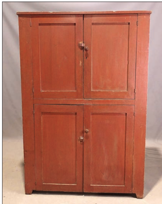
Doubling its high estimate to sell for $2,400 was this Nineteenth Century Shaker two-door cupboard in old red paint, 49 by 17 by 69½ inches.