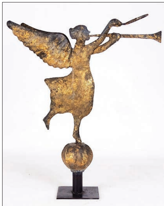
Angel Gabriel weathervane, stand included at 14 by 14½ inches, realized $2,640.

A painted Parker “Jumper” carousel horse came with appraisal and identification information from well-known carousel dealer Donald “Rusty” Donahue. It leapt to $3,000.