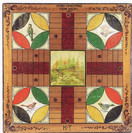
Soaring from a $1/1,500 estimate to a final price of $7,500, a Nineteenth Century painted board was marked "Merry Christmas From Hazel 1895."