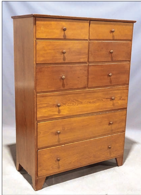
Among the sale’s 65 Shaker lots, foremost was this Nineteenth Century Shaker Mount Lebanon nine-drawer chest, 43½ by 20½ by 62½ inches, which sold for $7,800.

Prices given include the buyer’s premium as stated by the auction house. The next sale is scheduled for February 11. For information, 518-329-1142 or visit www.copakeauction.com .