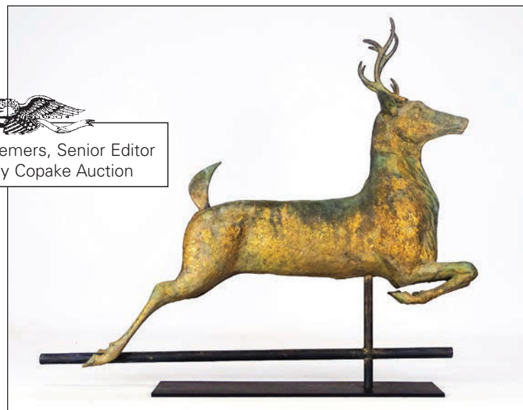
Top selling weathervane in Copake's sale was a leaping stag example, stand included, 29 by 26 inches, which cleared its $6,000 high estimate to finish at $8,100, the high price in the sale.