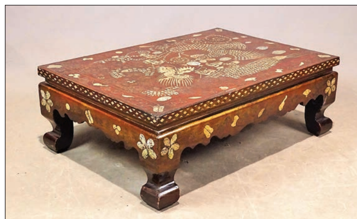
A Korean low decorated table, 39 by 27 by 14 inches, rose from a $200/300 estimate to a final price of $4,500.