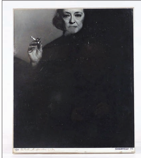
Bette Davis eyes look out from this moody photographic portrait of the American actress by Victor Skrebeneski. The photograph soared from $500-$1,000 to $5,400. Marked “2/12 For Betty with Admiration Victor,” the 23-by-19½-inch image had been willed to the consignor from Davis.