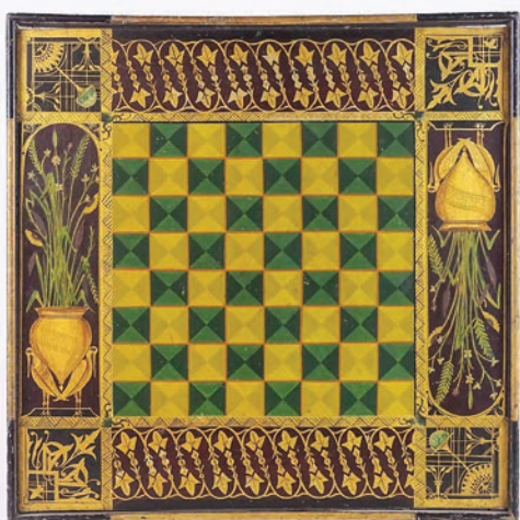
From the Gliedman estate, a New England painted wood game board soared from a $1/1,500 estimate to a final price of $6,300. Measuring 21 by 20½ inches, it was ex-collection of Charles Flint.