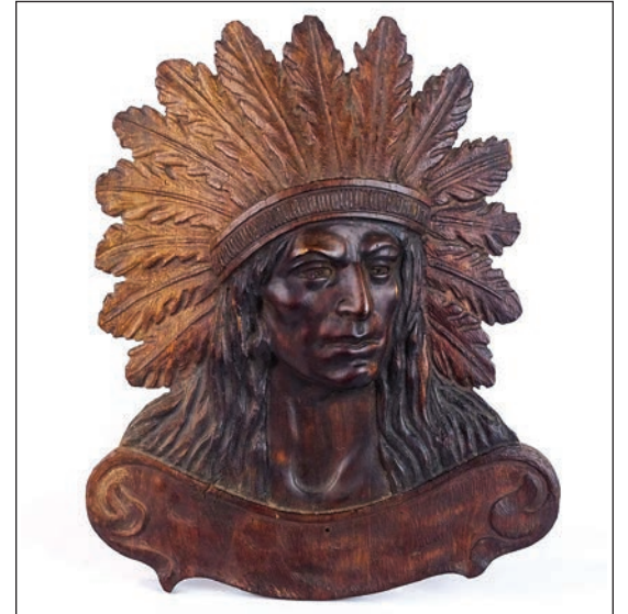
The early wooden carving of an American Indian ($200/300) commanded $2,400.