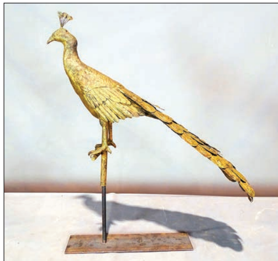
Fetching $2,760 was a peacock weather-vane, 30 by 21 inches, stand included.