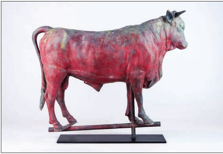
A full-bodied bull weathervane, base included, 24 by 21 inches, charged to $3,720.