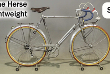
Rene Herse Lightweight