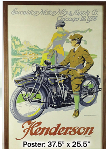
Poster: 37.5" x 25.5"