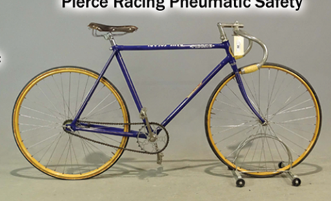
Pierce Racing Pneumatic Safety