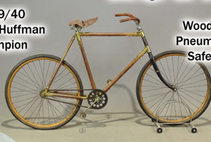
Wooden Pneumatic Safety