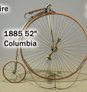
1885 52" Columbia