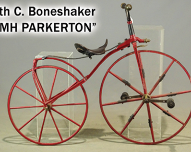
19th C. Boneshaker "WMH PARKERTON"