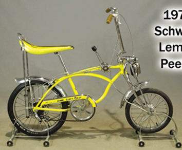
1970 Schwinn Lemon Peeler