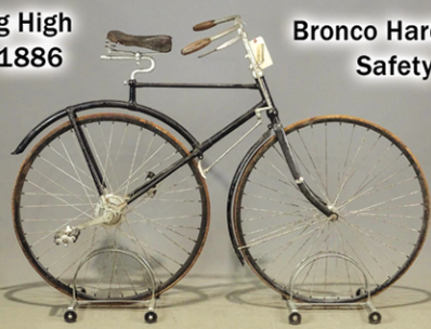
Bronco Hard Tire Safety