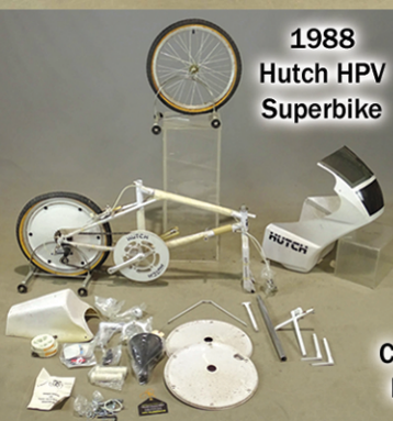
1988 Hutch HPV Superbike

A Presentation by Lorne Shields Friday October 14, 2022 @ 1-2PM