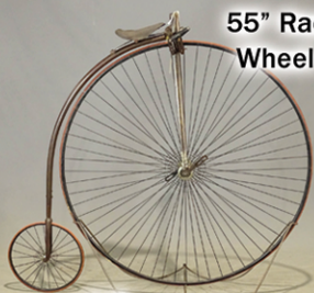
55" Racing High Wheel c. 1886

900 LOTS Including Bicycles and Bicycle & Automobilia related items.