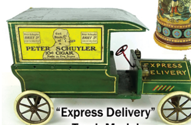
"Express Delivery" Truck Model