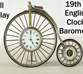
19th c. English Clock-Barometer