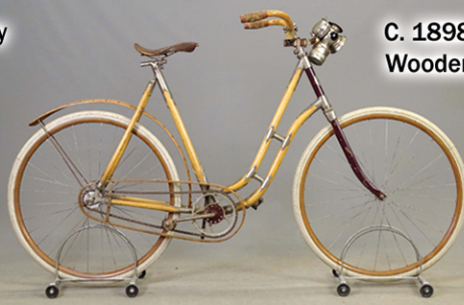
C. 1898 Chillion Wooden Bicycle