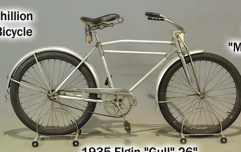
1935 Elgin "Gull" 26"