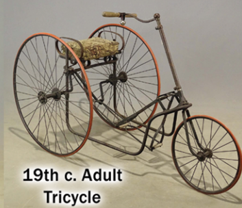
19th c. Adult Tricycle