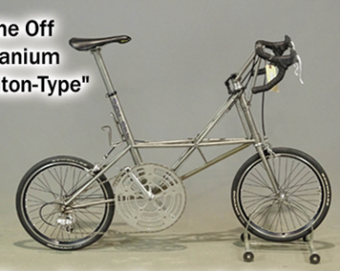
One Off Titanium "Moulton-Type"