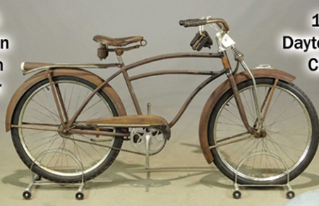
1939/40 Dayton/Huffman Champion