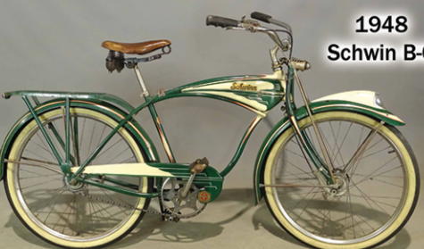
1948 Schwinn B-6