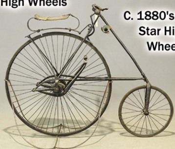
C. 1880's Pony Star High Wheel