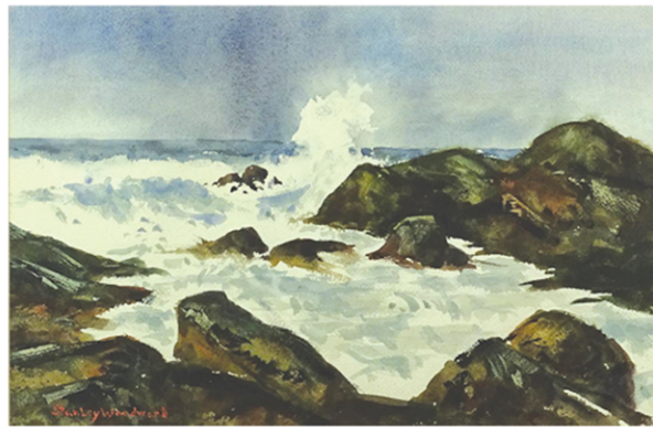
Stanley Wingate Woodward