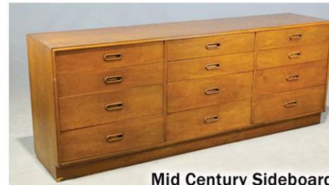
Mid Century Sideboard