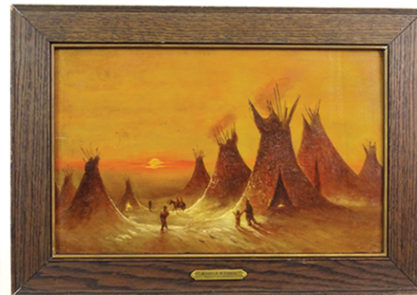
Astley David Middleton Cooper