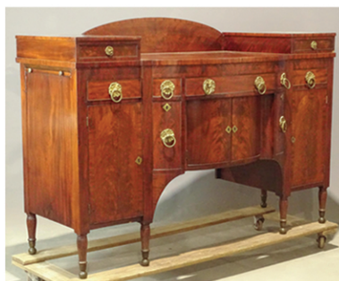
19th C. English Sideboard