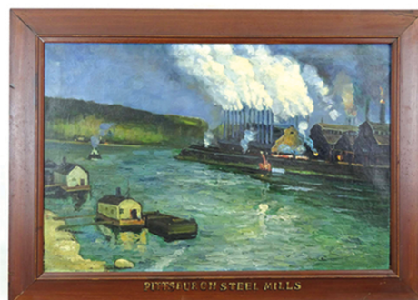
"Pittsburgh Steel Mills"