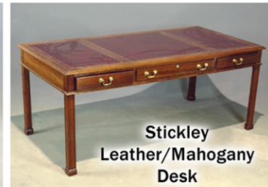
Stickley Leather/Mahogany Desk