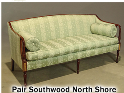
Pair Southwood North Shore Style Sofas