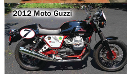
2012 Moto Guzzi