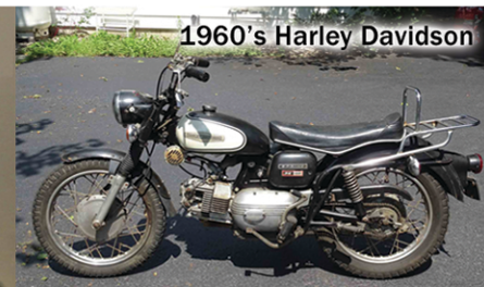
1960's Harley Davidson