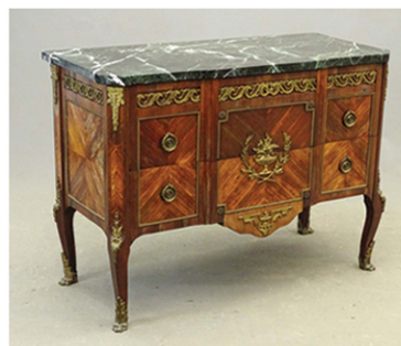
19th C. French Marble Top Chest