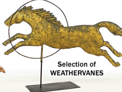
Selection of WEATHERVANES