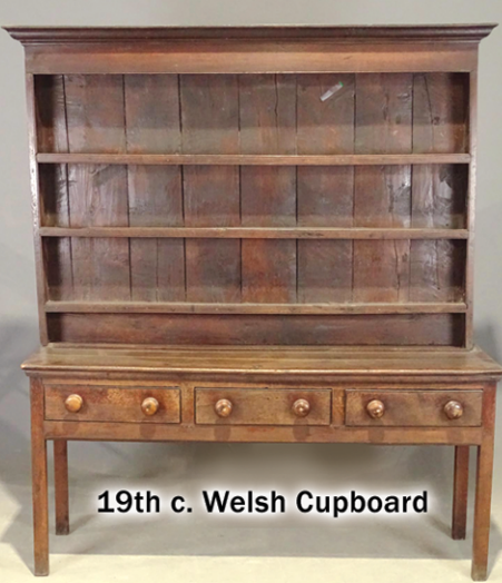
19th c. Welsh Cupboard