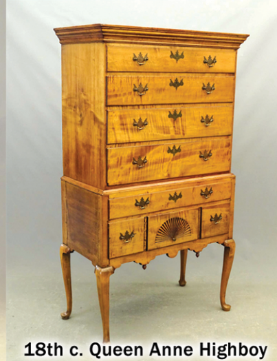
18th c. Queen Anne Highboy