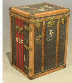
Goyard Steamer Trunks