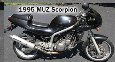
1995 MUZ Scorpion

PREVIEW & BID ONLINE : WWW.COPAKEAUCTION.COM