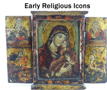
Early Religious Icons