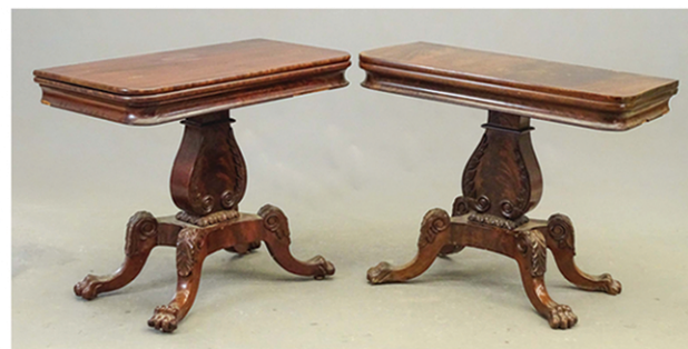
Pair of 19th c. Phila. Card Tables