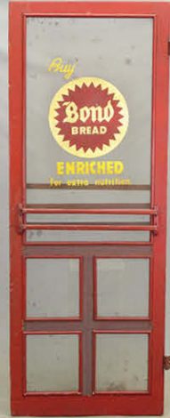
Bond Bread Door