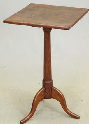
19th c. Shaker Candlestand