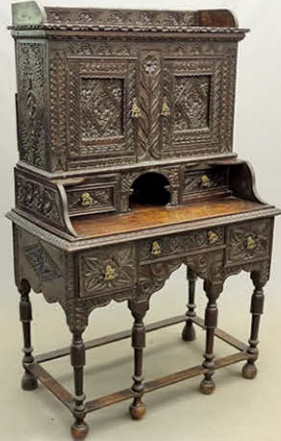
English Jacobean Carved Desk