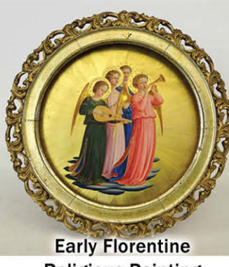
Early Florentine Religious Painting