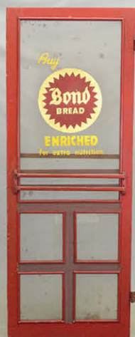
Bond Bread Door