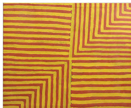
Turkey Tolson Tjupurrula (1938-2001)