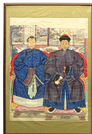
Asian Ancestral Double Portrait