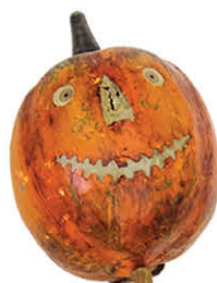
Halloween Pumpkin Parade Lantern