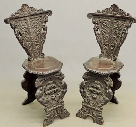
Pair Early Carved Italian Sgabello Chairs