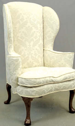
18th c. English Queen Anne Wing Chair