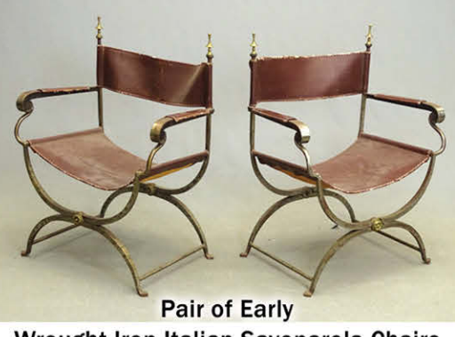
Pair of Early Wrought Iron Italian Savonarola Chairs