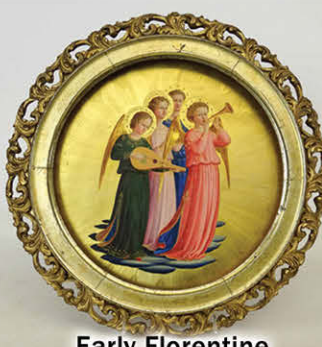
Early Florentine Religious Painting