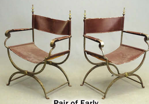
Pair of Early Wrought Iron Italian Savonarola Chairs