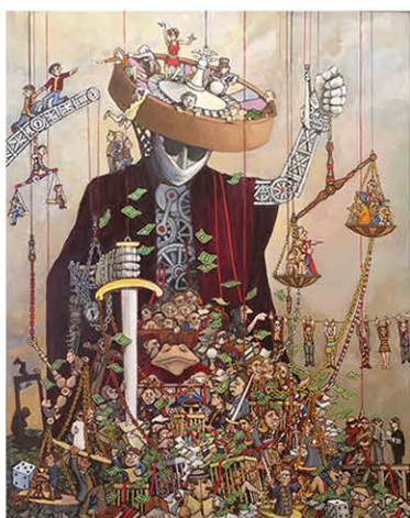
Bruce MacDonald (20th Century)