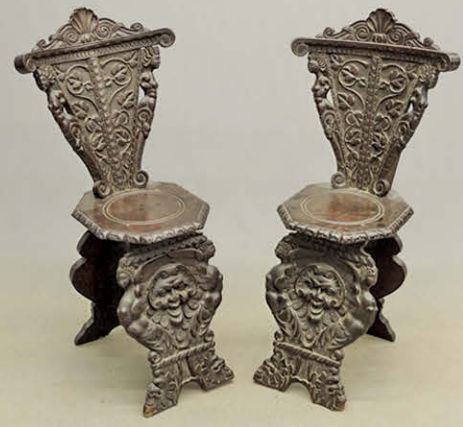
Pair Early Carved Italian Sgabello Chairs