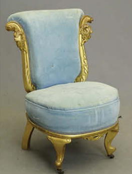
Louis XV Slipper Chair