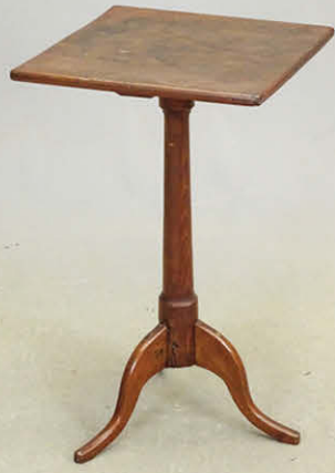
19th c. Shaker Candlestand