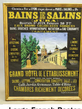
Large French Poster