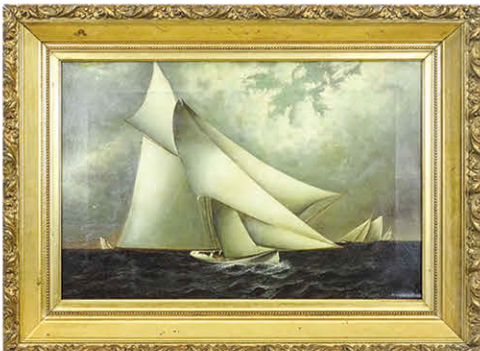
19th c. Seascape