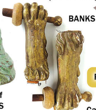
Early Venetian Carved Arm Sconces