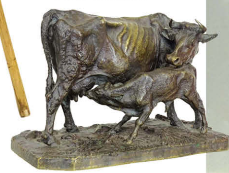
Pierre Jules (PJ) Mene (1810-1879)