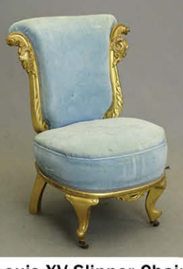
Louis XV Slipper Chair