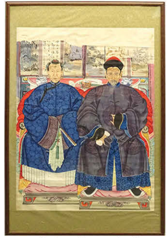
Asian Ancestral Double Portrait