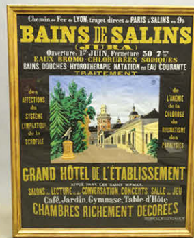
Large French Poster