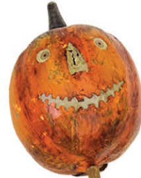
Halloween Pumpkin Parade Lantern