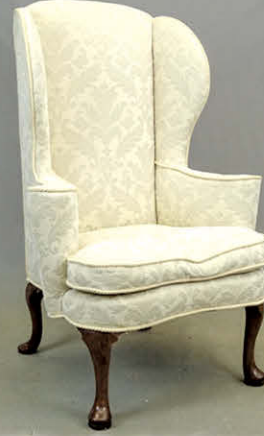
18th c. English Queen Anne Wing Chair