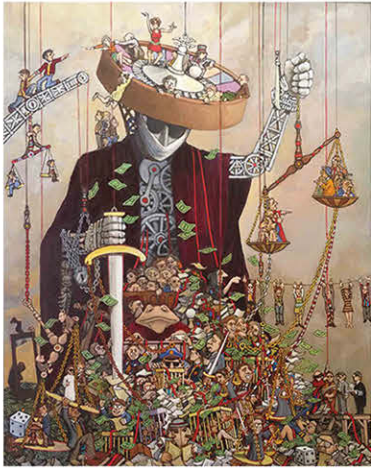
Bruce MacDonald (20th Century)