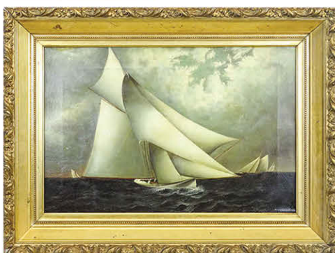
19th c. Seascape