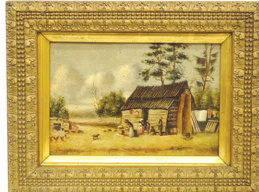
Style of William Aiken Walker