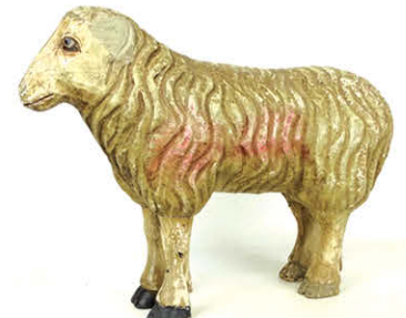
Folk Art Carved Lamb