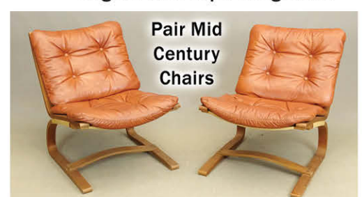
Pair Mid Century Chairs