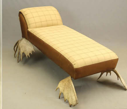
Adirondack Horn Settee