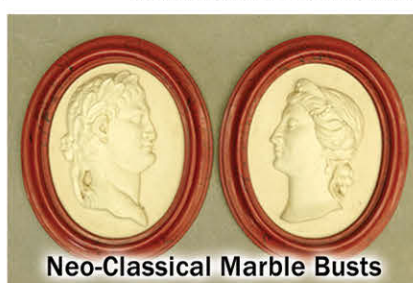
Neo-Classical Marble Busts