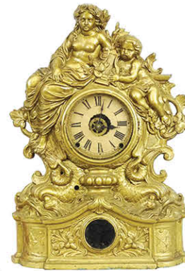
Victorian cast iron figural clock. Labeled "American Clock Company"