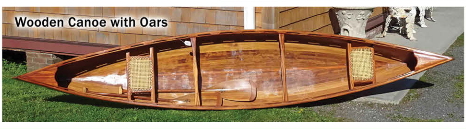
Wooden Canoe with Oars