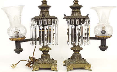
19th c. Argand Lamps