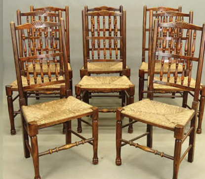
Set of (8) Yorkshire Chairs