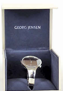
George Jensen Vivianna Bangle Watch