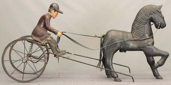
Folk Art Horse & Jockey