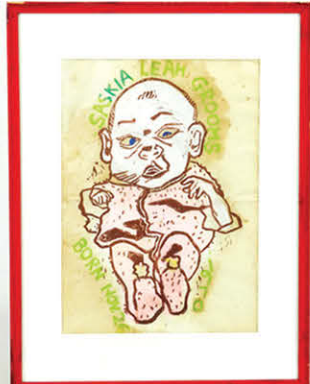
Red (Charles Rogers) Grooms