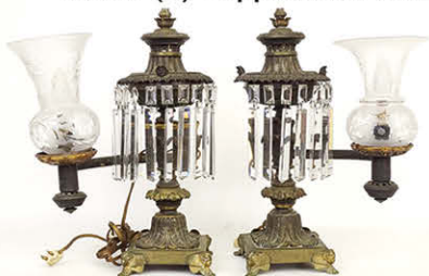
19th c. Argand Lamps