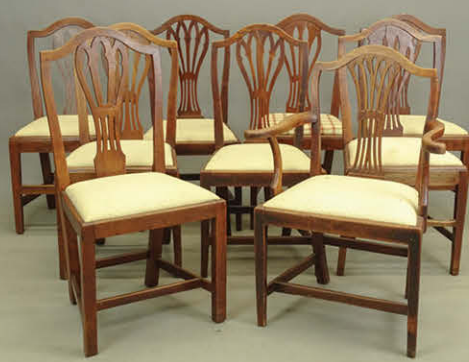
Set of (9) Hepplewhite Chairs