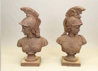
Pair of Cast Iron Roman Busts