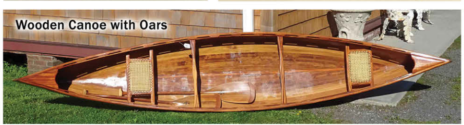
Wooden Canoe with Oars