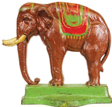
Selection of Doorstops