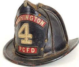
"CAIRNS & Brother" Fire Helmet (Porchester N.Y.)