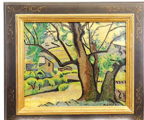
Andre Lhote (French 1885-1962), "Landscape in Provence"