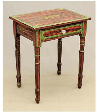
19th c. Paint Decorated Stand