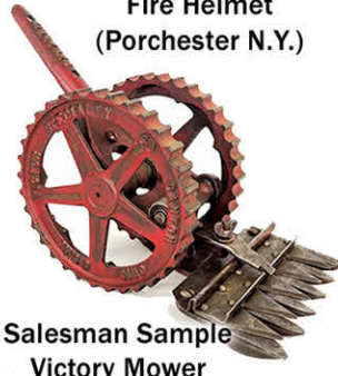
Salesman Sample Victory Mower