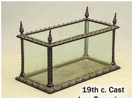
19th c. Cast Iron Terrarium