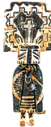
Early Religious Carving