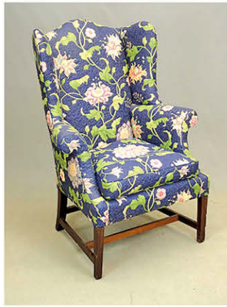
18th c. Chippendale