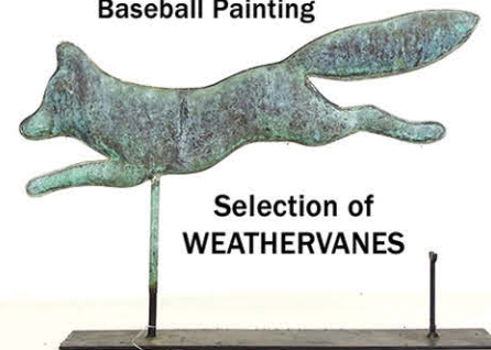
Selection of WEATHERVANES