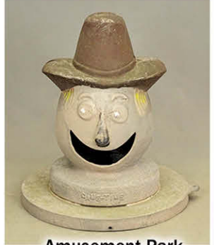
Amusement Park Clown Trash Can Lid