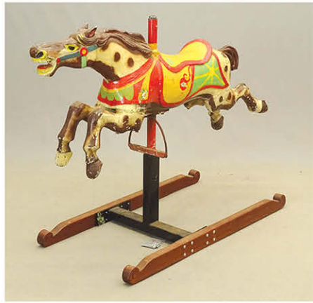
Cast Metal Carousel Horse