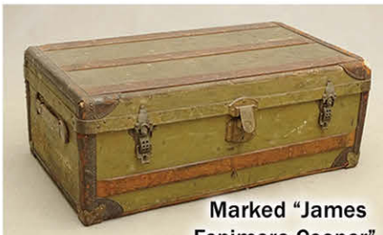
Marked "James Fenimore Cooper"