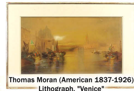
Thomas Moran (American 1837-1926) Lithograph, "Venice"