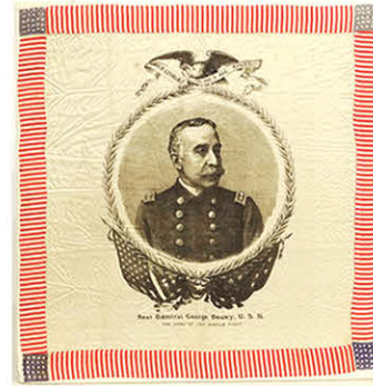
George Dewey Silk Handkerchief