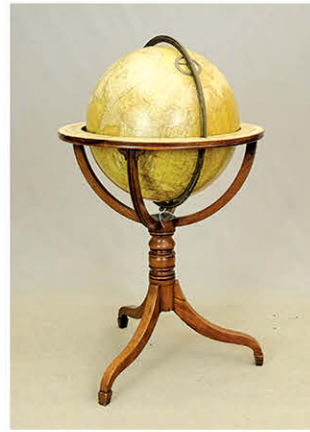
Victorian Bardin Floor Globe