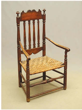
18th c. Banister Back