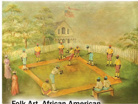
Folk Art, African American Baseball Painting