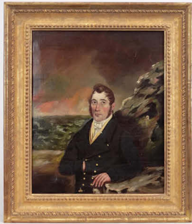
American School, 19th c. Ship's Captain