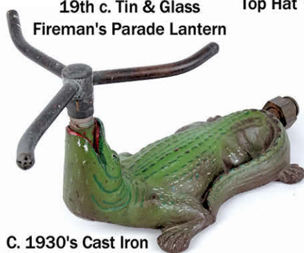
C. 1930's Cast Iron Alligator Water Sprinkler