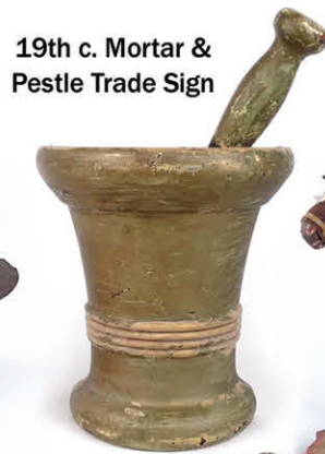
19th c. Mortar & Pestle Trade Sign