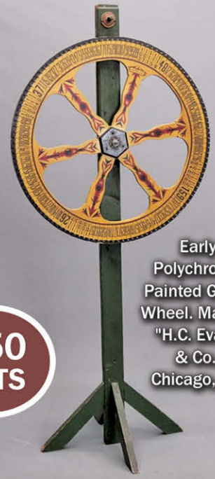
Early Polychrome Painted Game Wheel. Marked "H.C. Evans & Co., Chicago, Ill."