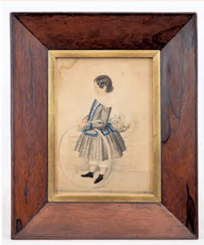
COLLECTION OF MINIATURE 19TH C. WATERCOLORS