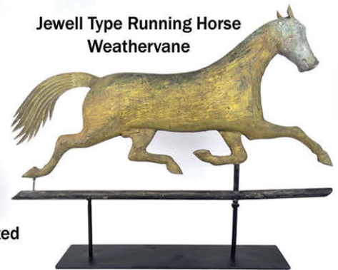
Jewell Type Running Horse Weathervane