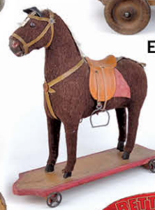
Early German Platform Horse