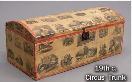
19th c. Circus Trunk