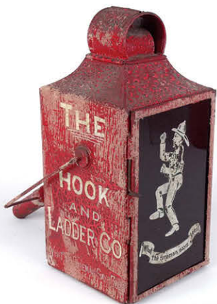
19th c. Tin & Glass Fireman's Parade Lantern