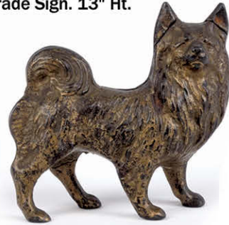
C. 1928 Spitz Dog Cast Iron Still Bank