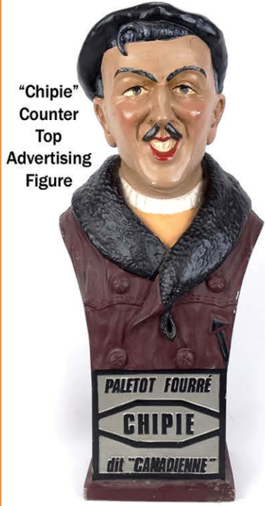
"Chipie" Counter Top Advertising Figure