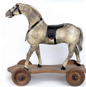
Early Wooden Painted Platform Horse