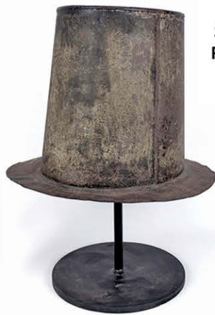
Top Hat Trade Sign. 13" Ht.