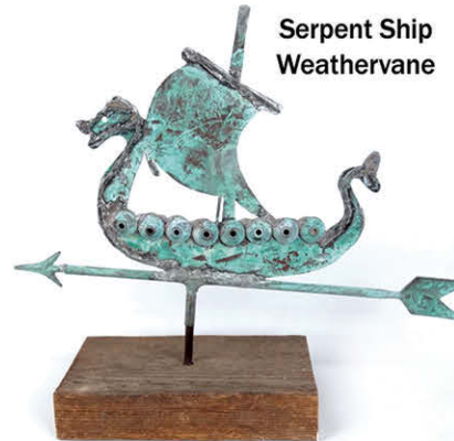
Serpent Ship Weathervane