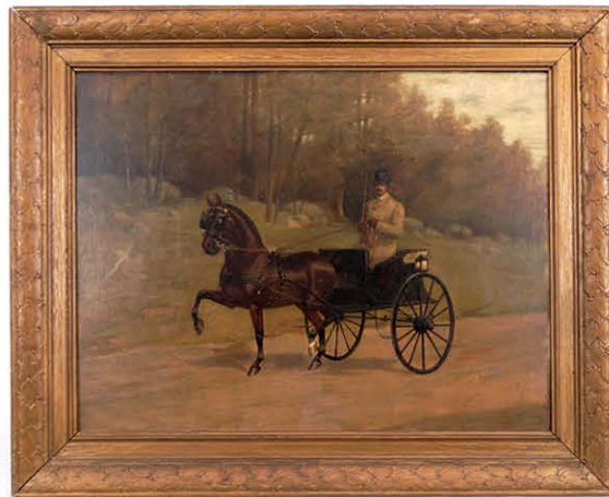
CB Fish (American b. C. 1860's), "Glorious Bonnie"