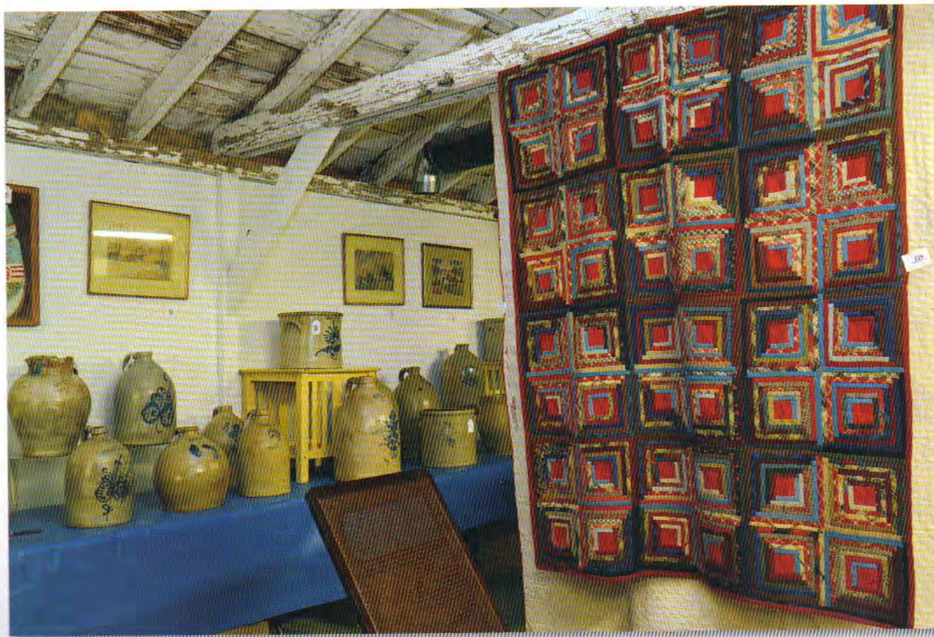
Log Cabin variation quilt!!