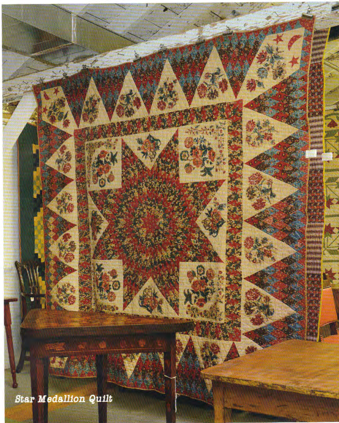
Star Medallion Quilt