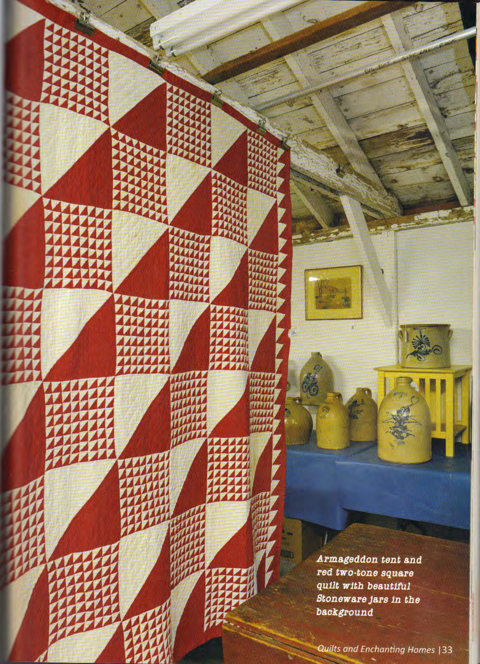
Armageddon tent and red two-tone square quilt with beautiful Stoneware jars in the background