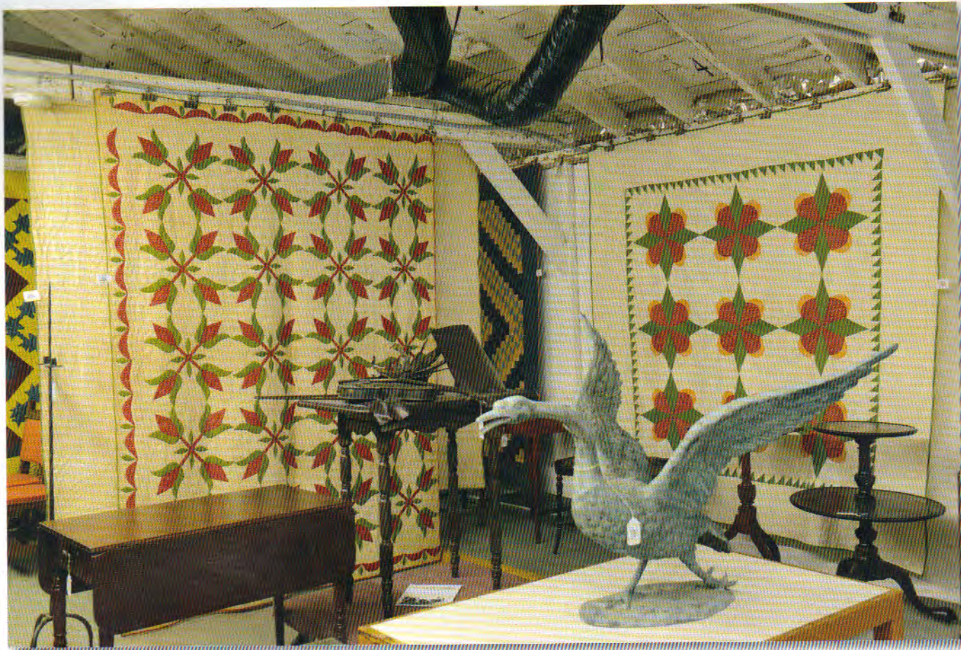
Rosebud quilt and a King's Crown variation